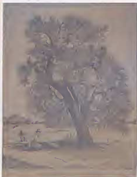
Drawing of Grevillea paniculata based on previous photograph (original in Club library)

would make jams and chutneys every season and a booklet of recipes was compiled, Quandong recipes .